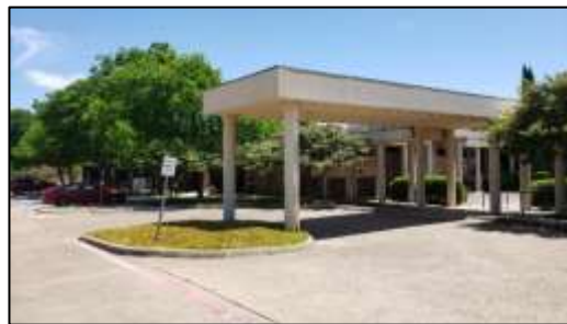
North side of St Barnabas (away from Belt Line Road)

Who: All members of LWV-Richardson Anybody interested in finding out about LWV-Richardson