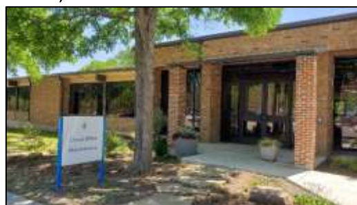
Hannah Hall entrance

Where: Hannah Hall at St Barnabas Presbyterian Church 1220 W Belt Line Road Richardson 75080